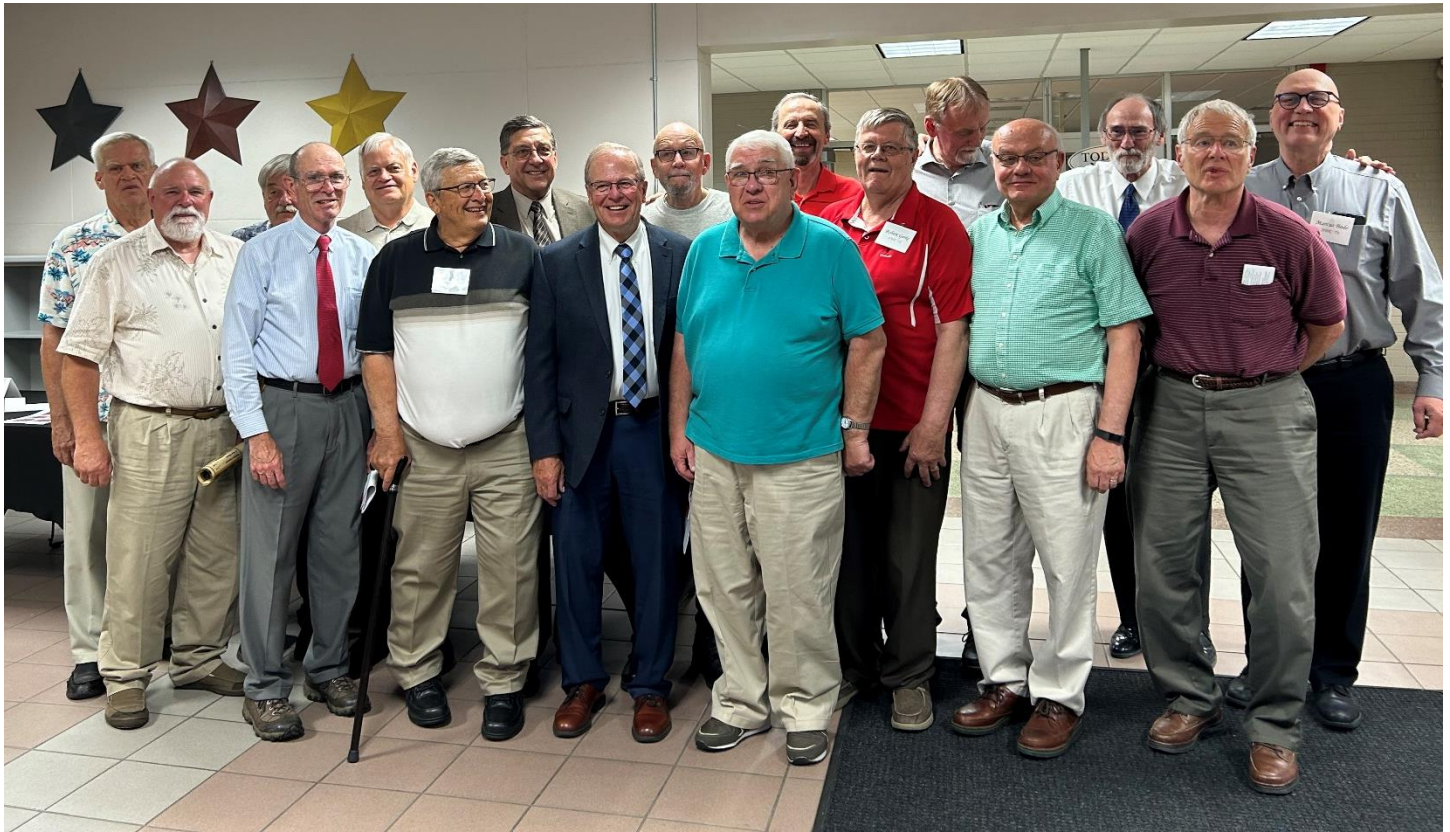
50 th Anniversary CLASS OF 1973 (17 of the 51 graduates in that class.)