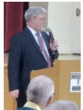
40 th (William)